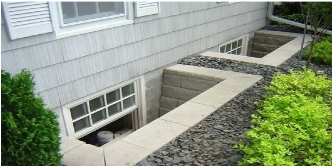
EGRESS WINDOWS IN BASEMENTS

When interior alterations, repairs, or additions requiring a permit occur, or when one or more sleeping rooms are added or created in existing dwellings, the individual dwelling unit shall be provided with smoke alarm(s) in accordance with IRC Section R317. This requirement also applies to window replacements.